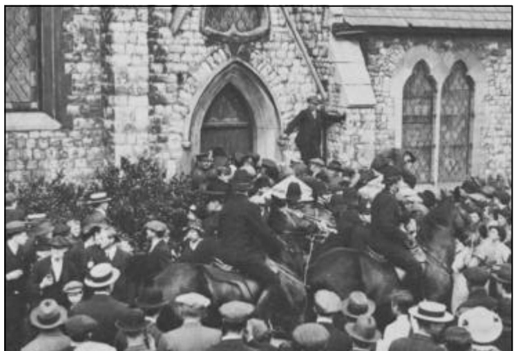
Anti-war meeting 1917

To deal with the expected opposition to conscription, the government had included a section in the Military Service Bill known as the 'conscience clause'. This allowed people exemption from conscription 'on the ground of a conscientious objection to the undertaking of combatant service'. The government knew there