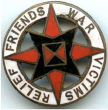
Red and black Quaker star

The Religious Society of Friends (Quakers) had been involved in large scale relief from suffering ever since the potato famine in Ireland (also known as The Great Hunger) of 1846-1849. A dedicated Quaker