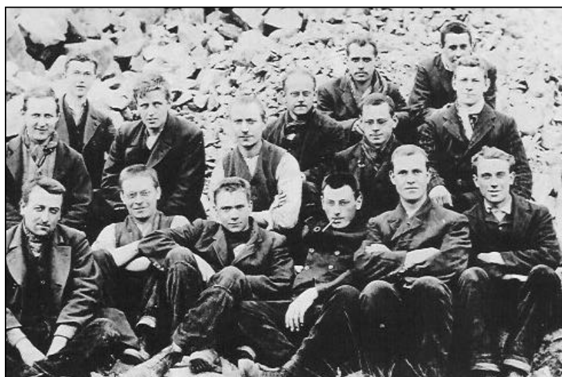
CO stone-breakers at Dyce Quarry near Aberdeen

MPs debated long and hard about which types of conscientious objector the new law would recognise. On the day of the final vote on the Military Service Bill there was great tension in parliament. Everyone knew the seriousness of the proposed new law and knew what a dramatic change it would be for Britain (Ireland was not included in the Bill). Out of 630 MPs in the House of Commons at the time 165 of them were already in the army or navy and most of those had come wearing their military uniform. Only 36 MPs opposed the Military Service Bill and so, on 27 January 1916, the Bill received the Royal Assent and became the law of the land.