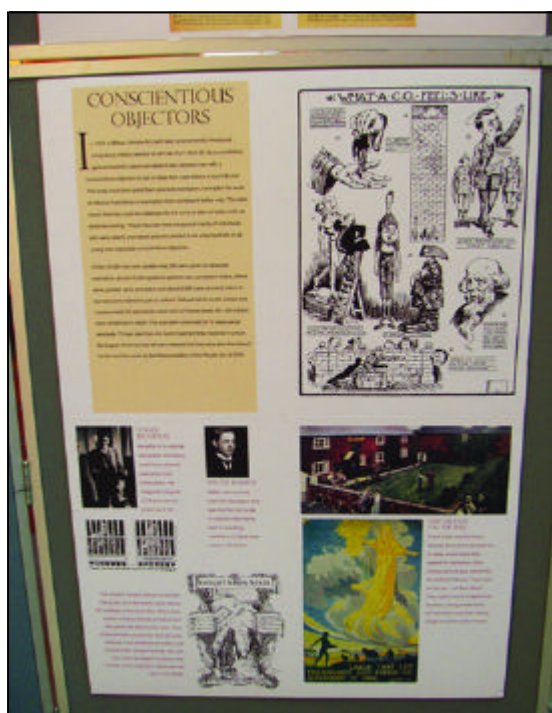
Panel from exhibition about Conscientious Objection available at the Working Class Movement Library, Salford

Working Class Movement Library, Salford - Exhibition and other documents about local COs - http:// www.wcml.org.uk/ncf