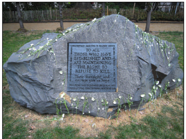
Conscientious Objectors Memorial in Tavistock Square London

The Peace Museum in Bradford will be hosting a temporary exhibition about Conscientious Objectors; dates to be confirmed. Please visit the exhibitions page at www.peacemuseum.org.uk for further information.