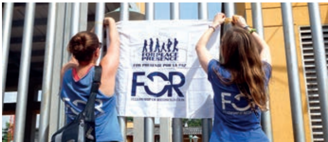
Protest at Government offices www.forpeacepresence.org

conflict is a reality. When FoR Peace Presence applied for funding for 2017 we read of their inspirational successes helping those such as the Peace Community of San José de Apartadó, Astrocampo (Association of Land Workers), and Tierra Digna. We all felt a strong desire to support their Accompaniment programme at a time when a major donor was no longer able to help. The dawn of hope offered by 2016's peace agreement between the Colombian government and the FARC, the main rebel group that has been fighting for 50 years, might convince observers from overseas that such accompaniment is of less value. The opposite is the case; the number of people under threat has risen significantly, partly because the two major combatant forces are not so active. Smaller factions and even civil authorities have increased their threats to ways of life and those seeking to defend them. With your help FoR Peace Presence have been able to maintain their commitments and extend these to include newly threatened groups. As I type this article they are about to embark upon accompanying in the Chocó region of Colombia with the Inter-Church Commission for Justice and Peace. These partners are helping to establish a new humanitarian space, free of armed actors, in a rural part of the country.