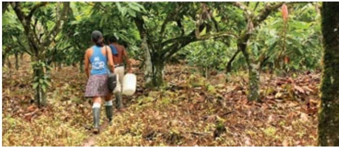
Accompanying a villager to get water

FoR's International Peacemakers' Fund has been giving grants to grassroots peacemakers for 12 years. Funded by members, sympathetic individuals and Trusts, we've made a difference, across the globe, where violent