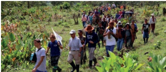
Marching peacefully between threatened communities